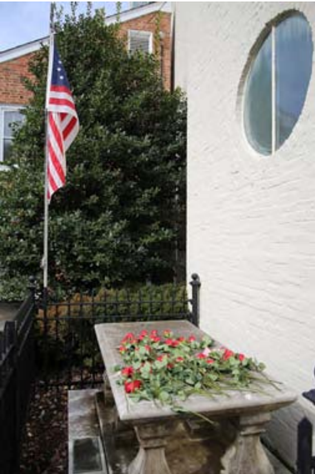
DAR and SAR Members, along with members of the public, paid their respects by placing flowers on the Tomb of the Unknown Soldier of the American Revolution.