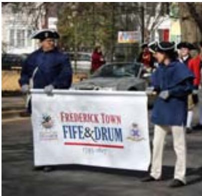
(Above)--The Frederick Town Fife & Drum Corps preparing to lead the SAR marching unit in the George Washington Birthday Parade.