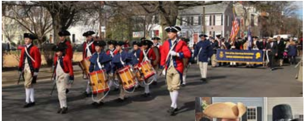
(Right)--Compatriots in period dress.