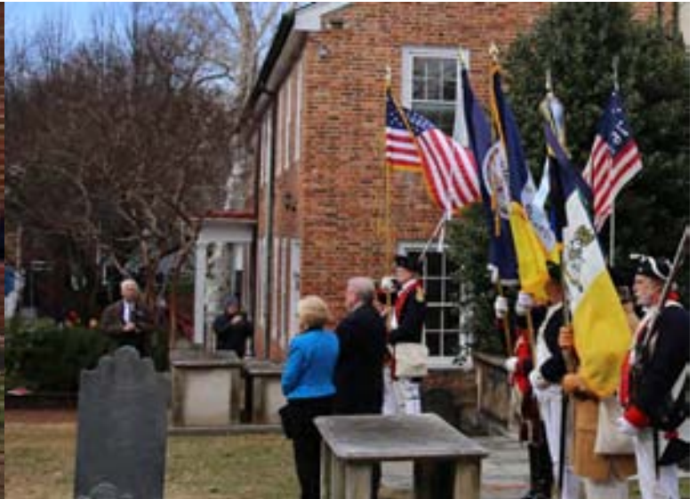
The VASSAR Color Guard presented the Colors, which were furthered honored by the Pledge of Allegiance.