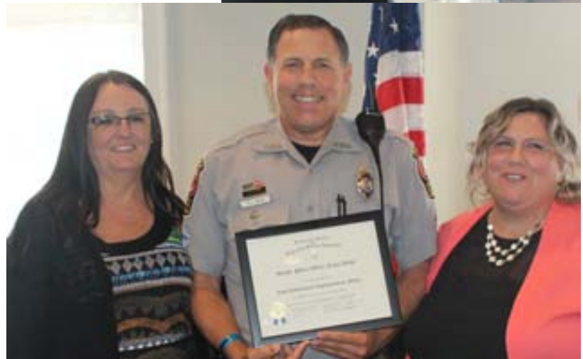
(Continued Next Page)