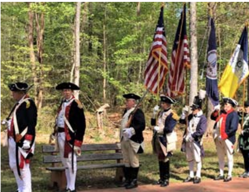
Below--VASSAR Color Guard