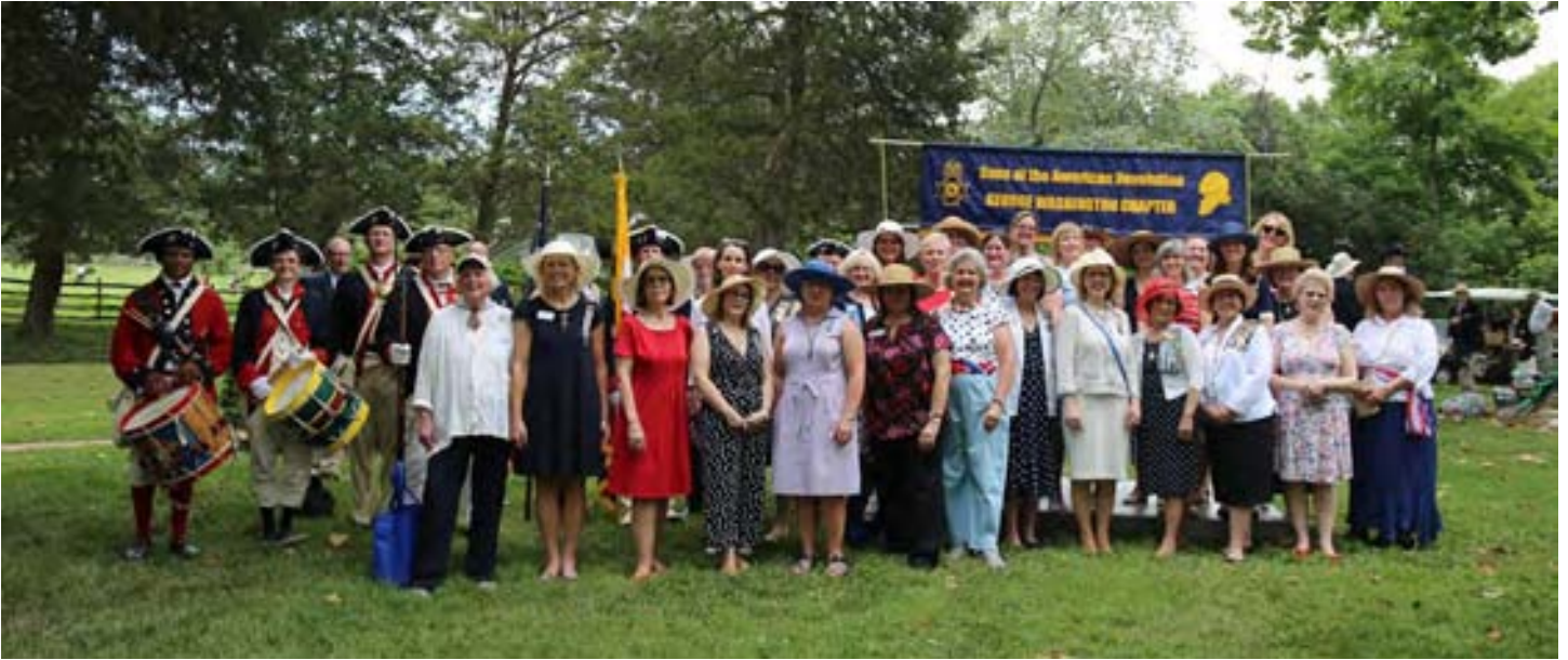
DAR at Mount Vernon on 4th of July