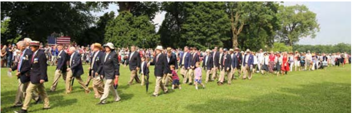
SAR at Mount Vernon on their way to pay respects to the General