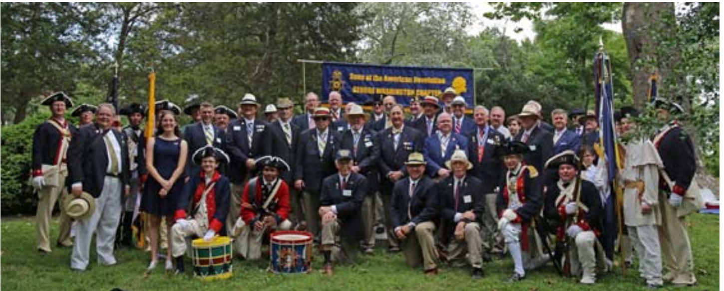
SAR at Mount Vernon on 4th of July