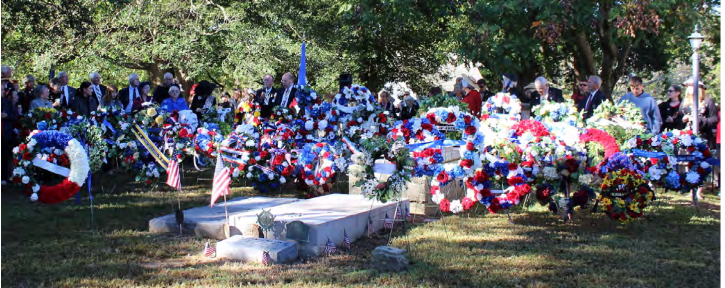
The wreaths that were presented at the Grave of Governor Thomas Nelson, Grace Church, Yorktown, Virginia.