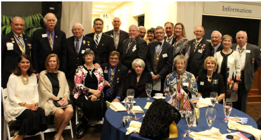
Compatriots at the Yorktown Museum of the American Revolution dinner the night before Yorktown Day.