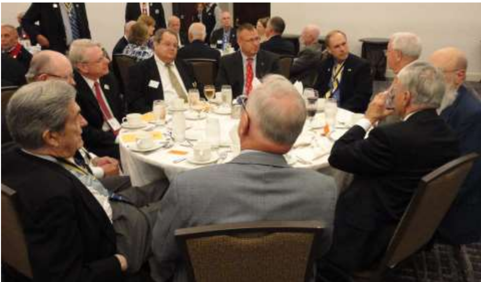
Members of the GW Chapter enjoy each other's company at the VASSAR Semi-Annual Meeting Luncheon