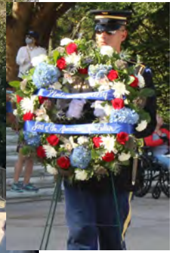
Tomb of The Unknown Soldier