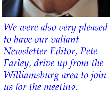
us for the meeting.