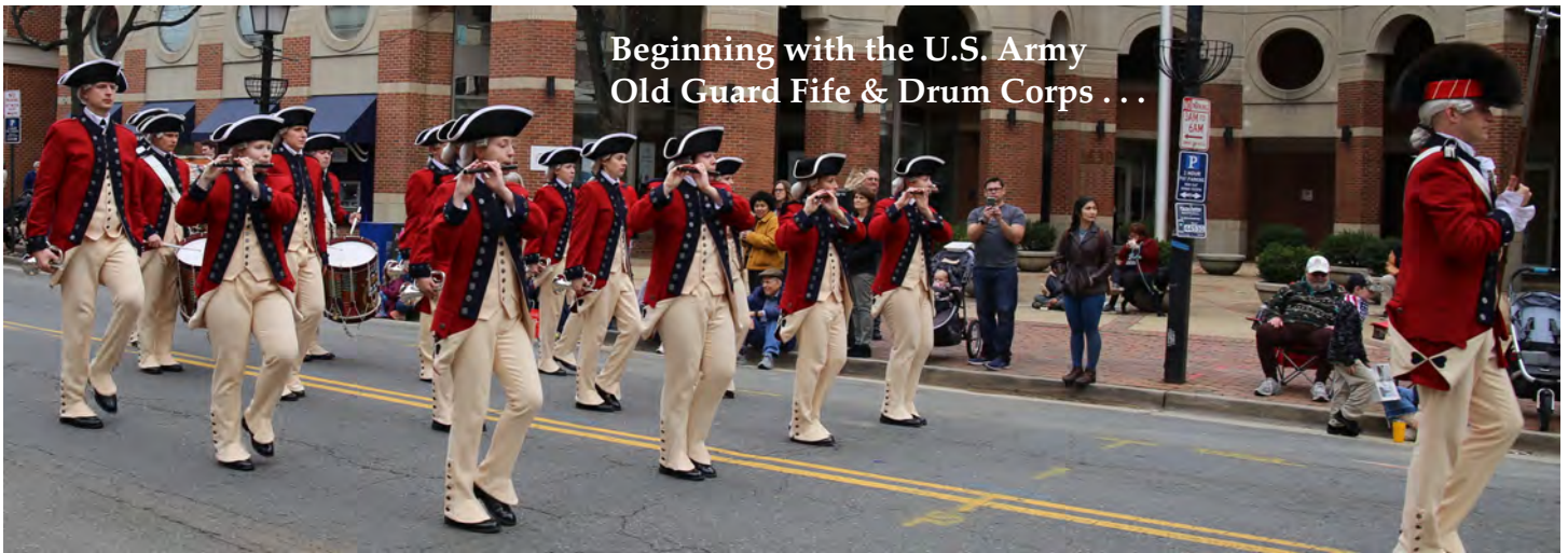
Beginning with the U.S. Army Old Guard Fife & Drum Corps ...