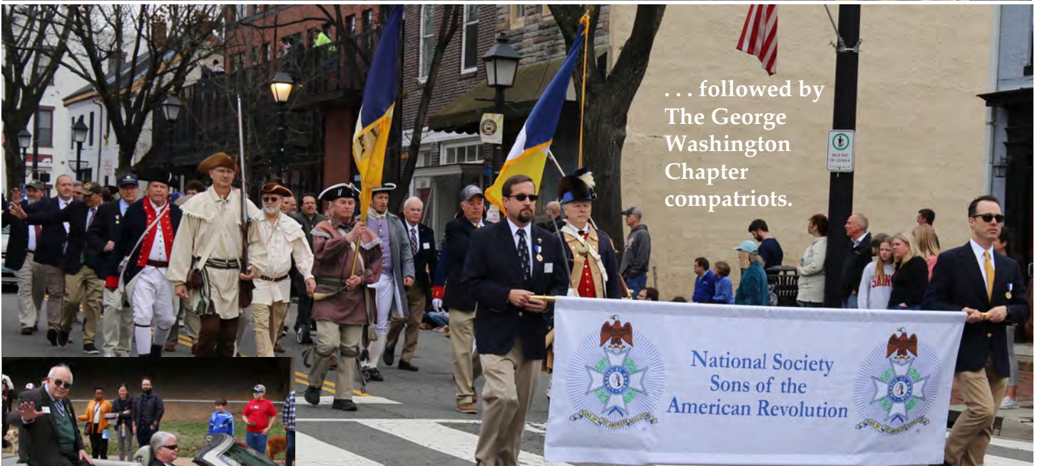
... followed by The George Washington Chapter compatriots.