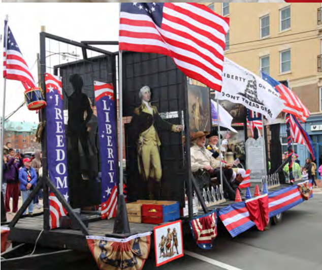
Left-patriotic float provided by the Sergeant Major John Champe Chapter.

Please see Page 11 for listing of Chapters attending.