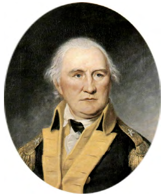
Daniel Morgan by Charles Willson Peale, circa 1794

The militiamen were not held in reserve for long. The Patriot infantry formed a wall for the British. Morgan led the militia to one side of the battle, while the cavalry went to the other. The British were surrounded in a U-shaped trap. This rare and powerful tactic, called a double envelopment, left Tarleton's army in shambles. Had Morgan neglected to give so much attention to his militia, he may not have been able to perform such a decisive attack. ( Con't on next page )